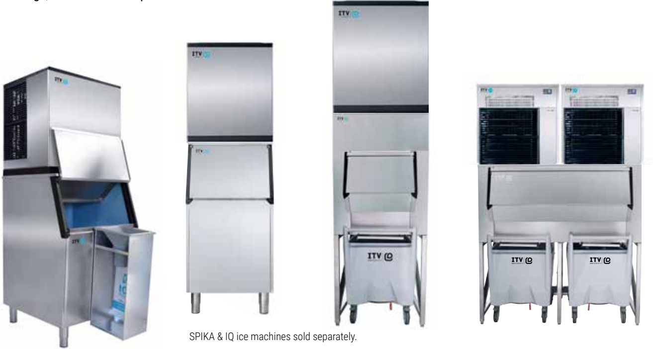
SPIKA & IQ ice machines sold separately.