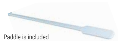
Paddle is included