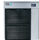
ICE QUEEN 500