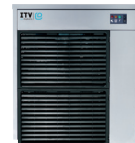
ICE QUEEN 300