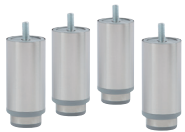
4 HEIGHT ADJUSTABLE LEG KIT