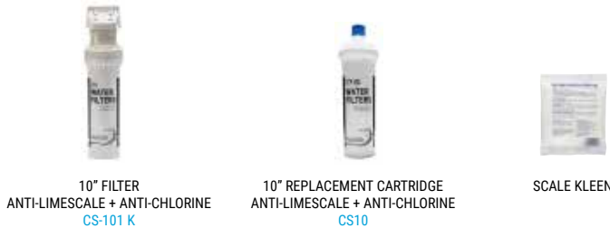
10" FILTER ANTI-LIMESCALE + ANTI-CHLORINE CS-101 K