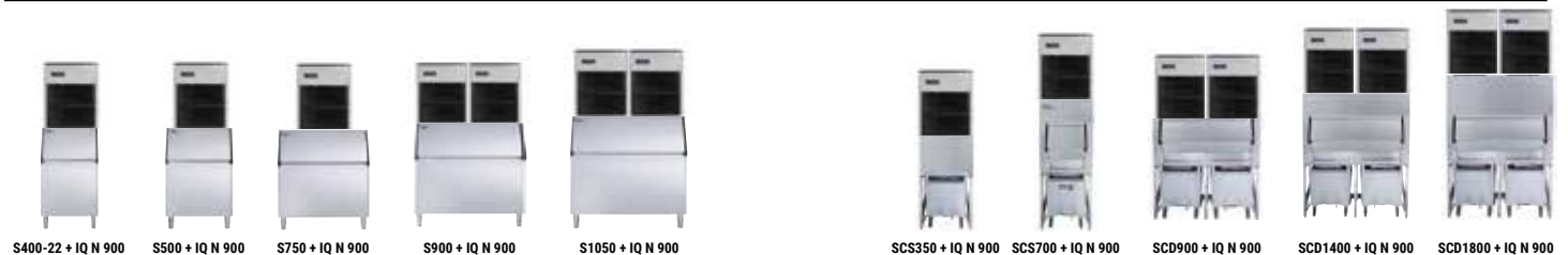
S400-22 + IQ N 900