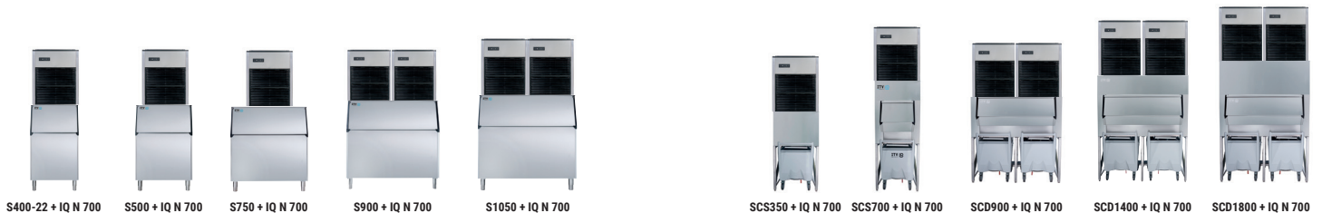
S400-22 + IQ N 700