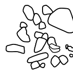
Dryer Type Ice