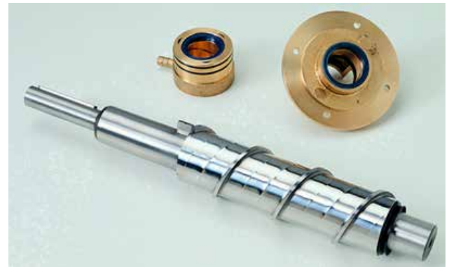
ITV's Patented Auger with 5 years parts warranty

If the use of your flake ice is for displaying, this is perfect fit for any shape of showcase. If for cocktails or smoothies, you achieve rapidly chilled beverages to enhance the refreshment of your drink.