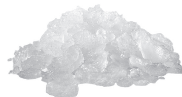
Dryer Type Ice