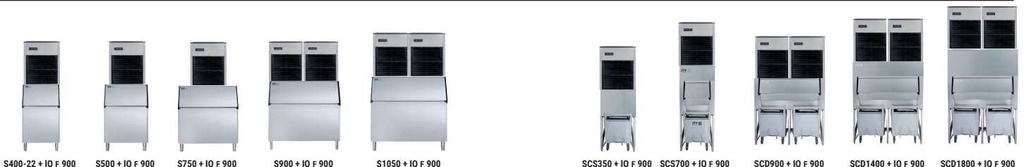
S400-22 + IQ F 900