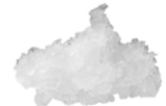
FLAKE ICE 85% ICE HARDNESS FACTOR