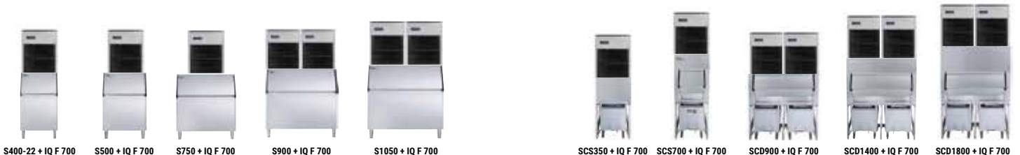
S400-22 + IQ F 700