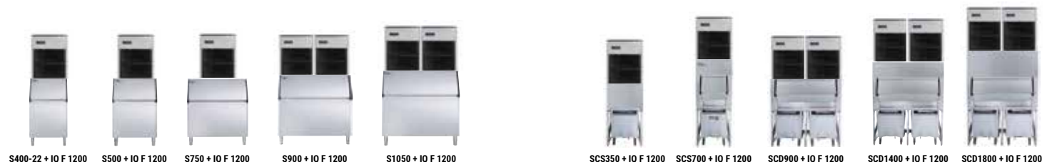
S400-22 + IQ F 1200