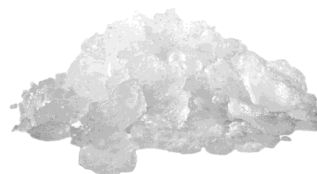
ICE QUEEN Flakes