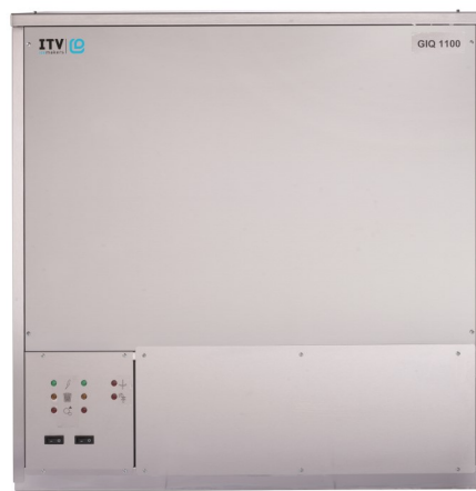
IQ 2700 R