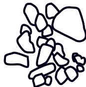
"Fine" Style Ice Flakes