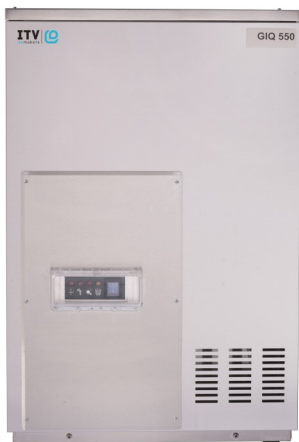
IQ 1300 R