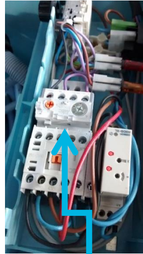
Non modular units: disconnect red cable or use cleaning switch if available.