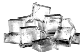
SPIKA Half Dice