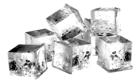
SPIKA Full Dice

*ITV's SPIKA MS 440 & MS 880 sold separately.