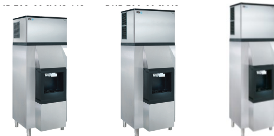
DHD 200-30 & *MS 440