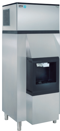
SIRION DHD 200-30 + SPIKA MS 500