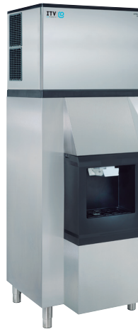
SIRION DHD 200-30 + SPIKA MS 1000