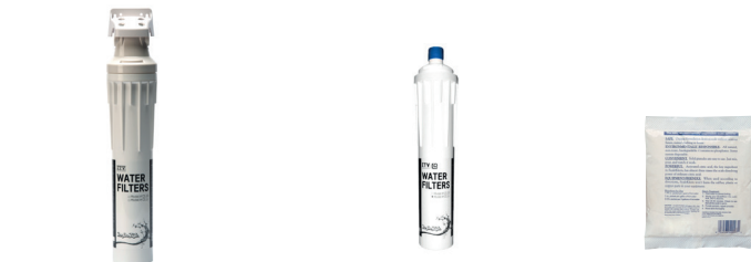
11" FILTER ANTI-LIMESCALE + ANTI-CHLORINE CS-111 K