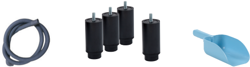
WATER OUTLET HOSE