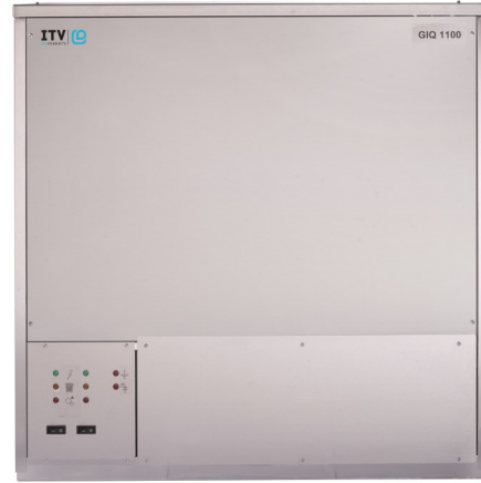
IQ 2700 R